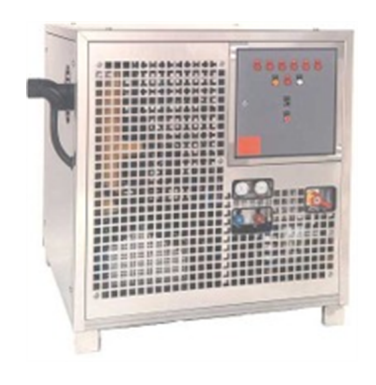
... in an industrial design.