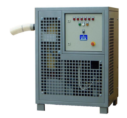
... in an industrial design.