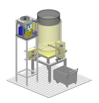
Silo AS 500 with ice machine