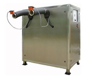
Ice maker with control system and stainless steel cabinet....