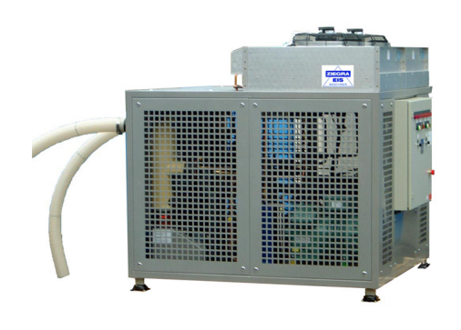
... in an industrial design.