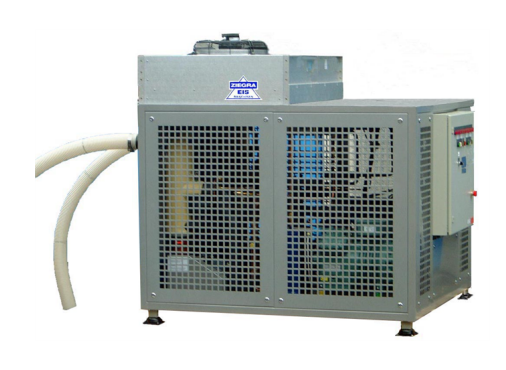
... in an industrial design.