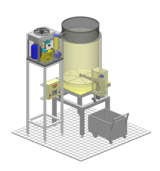
Silo AS 500 with ice machine