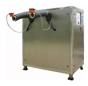
Ice maker with control system and stainless steel cabinet....