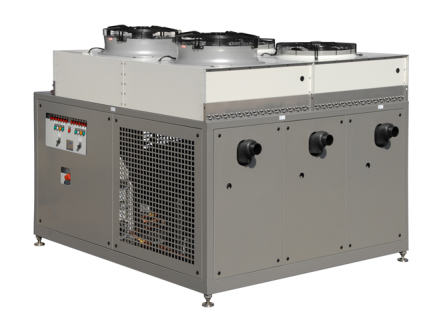
... in an industrial design.